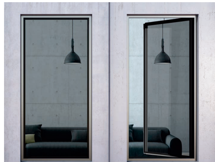
Minimal Casement doors & windows