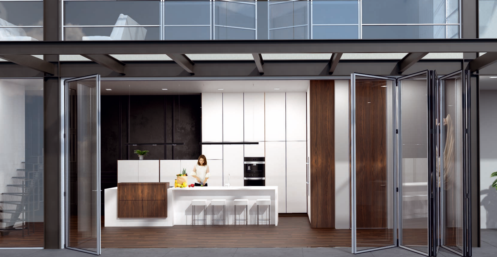
Minimal Folding Systems